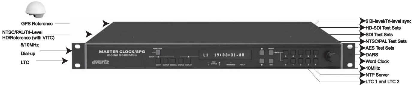
5600MSC Signal Inputs / Outputs