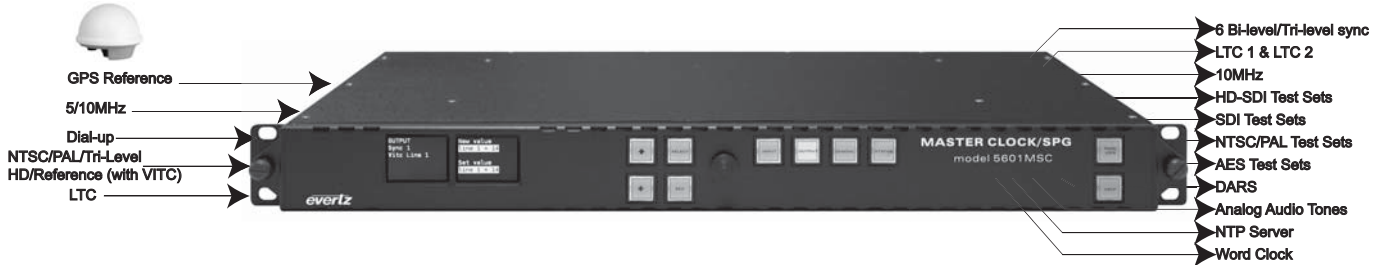
5601MSC Signal Inputs / Outputs