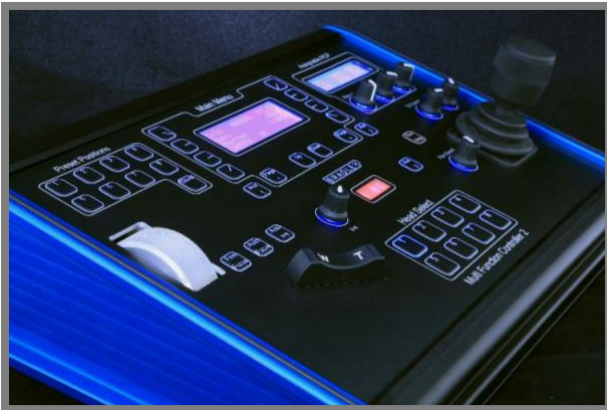
Multi Function Controller

Joystick Controllers Remote Camera Panels Radio data links Fibre Converters IP Converters